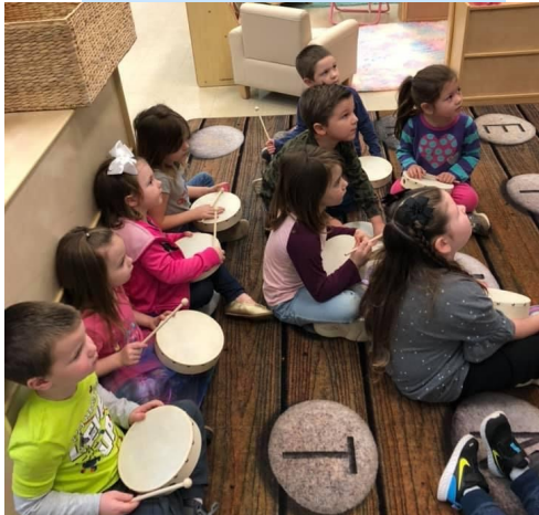
Preschool practices Indigenous drumming for Indian Education program.

Nope, it is not new shower curtains in the shop! It is new welding booths!